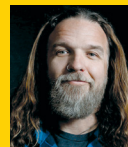
Poncho Parker Host 92.1 CITI FM